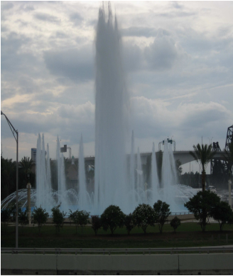
Friendship Fountain Jacksonville