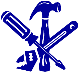
NMC turns the nuts and bolts to make the meetings work.

The National Meetings Committee takes the lead in planning and organizing the USPS Annual Meetings and the USPS Governing Board Meetings.