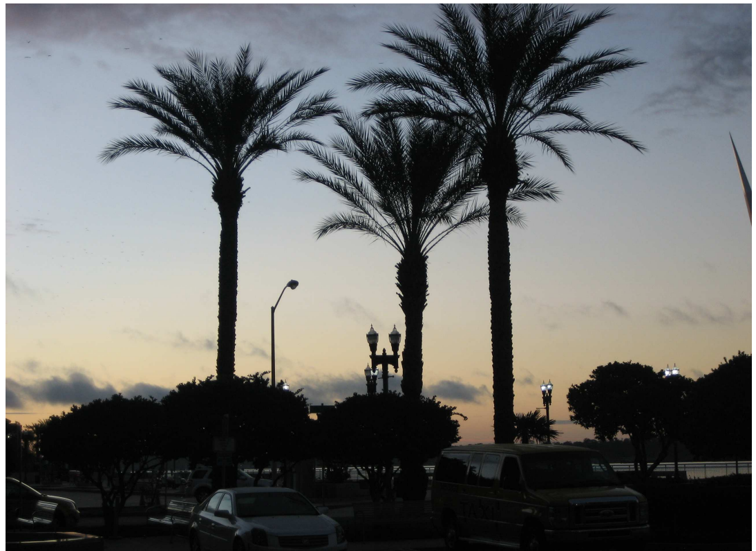
Jacksonville Riverfront looking from the Hyatt to the St Johns River at dawn October, 2011