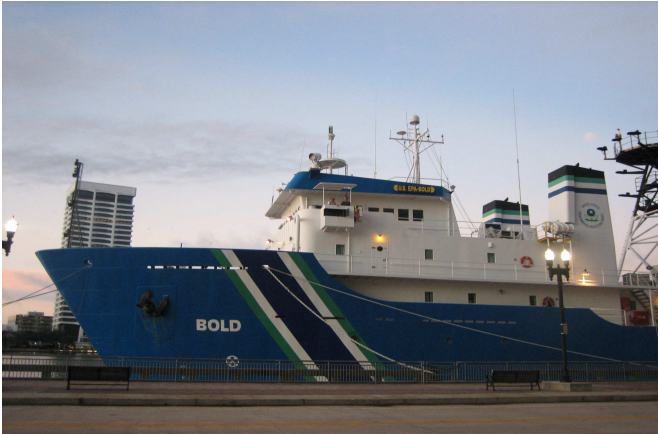
Look out of the hotel and some-

times see a large ship parked out front on the St Johns River, like the Environmental Protection Agency ship, BOLD.