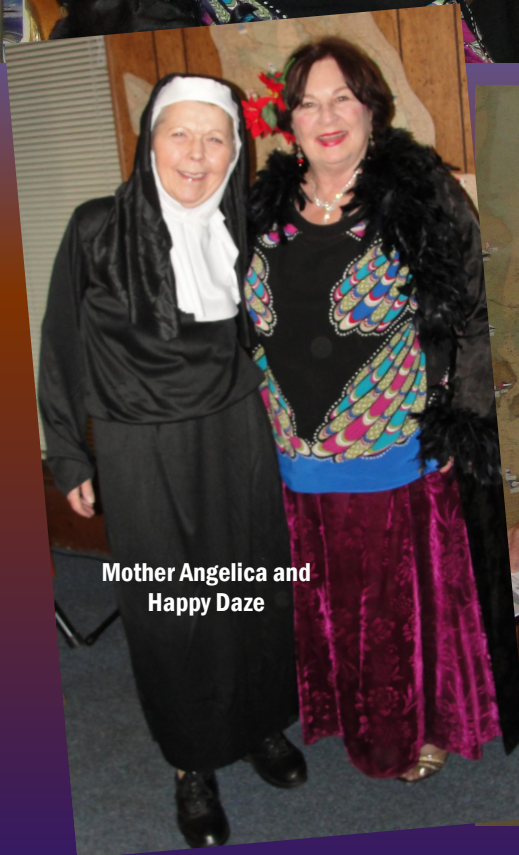
Mother Angelica and Happy Daze