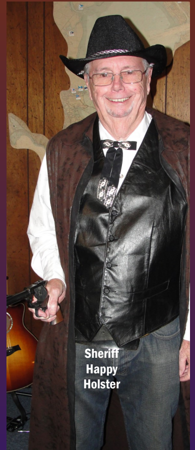
Sheriff Happy Holster