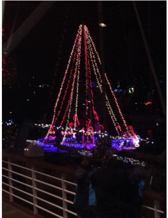
P/C Alan Smith, P captured this photo during the Oakland Estuary Lighted Boat Parade on December 3 at Jack London Square.

examination during this timeframe will have six months from the effective January 1, 2018 implementation date to apply for their California Boater Card to receive the "grandfathering" exemption regardless of their age. Older courses may not include recent state or national changes to navigation law. There are a few exemptions such as visitors to the state, rentals and for those holding professional license issued by the United States Coast Guard.