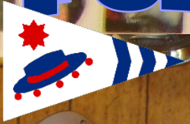
Amateur Detective Happy Daze

Opening Night Performance of Peralta's Christmas Cows Production.