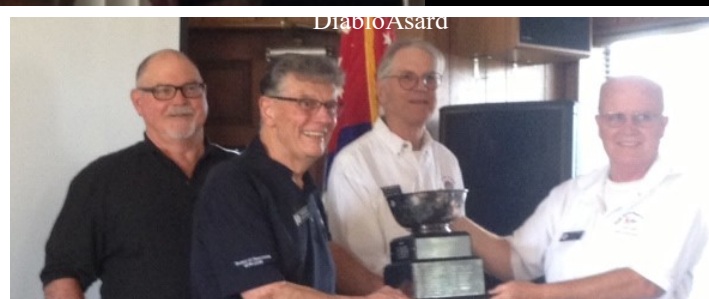
The McKissick Award was presented to Diablo Squadron for best all-around performance based on the number of students completing courses, factored by membership.