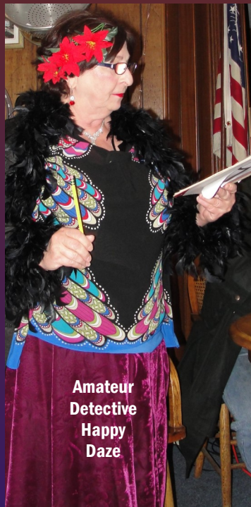
Amateur Detective Happy Daze