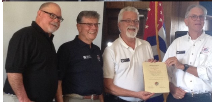
The Bateson Birkett Award was given for the greatest number of members completing Instructor Development, also factored by membership.

At left is the winner of the Prince Henry Award – most students completing JN or N. Winner was Diablo Squadron with one student.