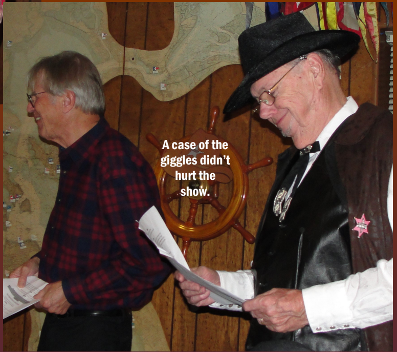
A case of the giggles didn't hurt the show.