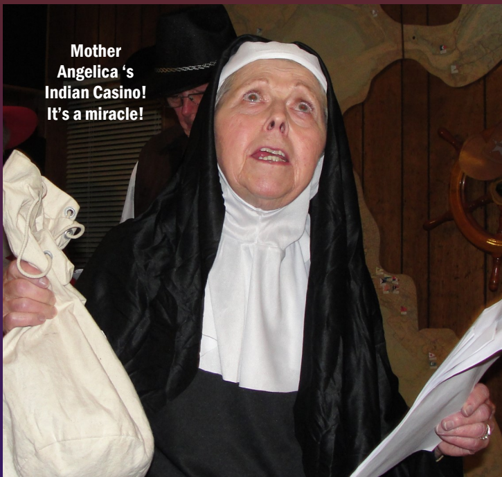
Mother Angelica's Indian Casino! It's a miracle!