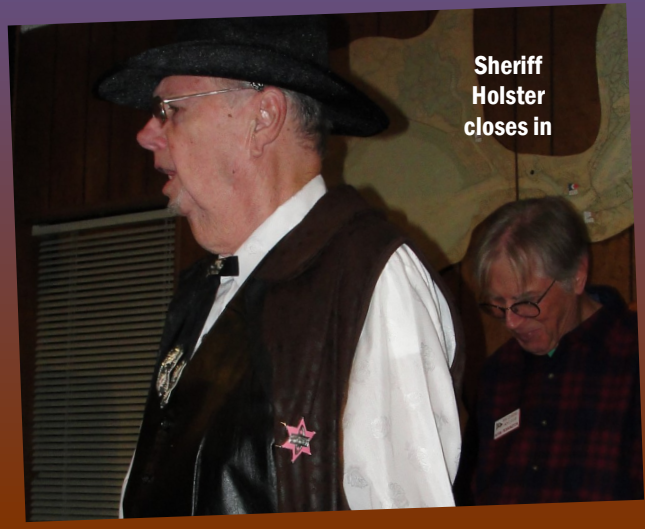
Sheriff Holster closes in