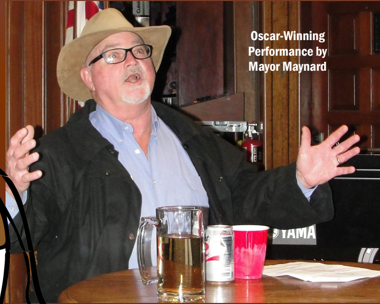
Oscar-Winning Performance by Mayor Maynard