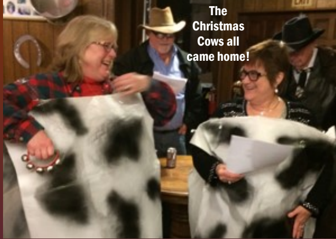
The Christmas Cows all came home!