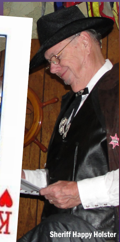
Sheriff Happy Holster

Proud recipient of multiple USPS National Distinction in Journalism Awards Quarterly publication of the Peralta Sail and Power Squadron, San Leandro, California